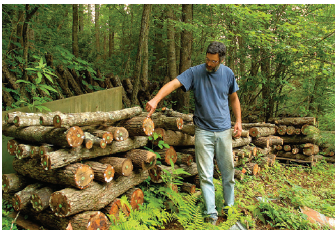
Figure 6. Crib stacking system..

Lean-to stacks are composed of vertical rows of logs supported against a horizontal rail or wire (Figure 7). Lean-to stacks are the best method to use when your land is hilly or steep. They do not require lifting logs to various heights, as with the crib stack system, and picking is easier. However, lean-to stacks require a large amount of space, and there are differences in temperature and humidity between the two ends of the logs. There are many variations on both of these stacking methods.