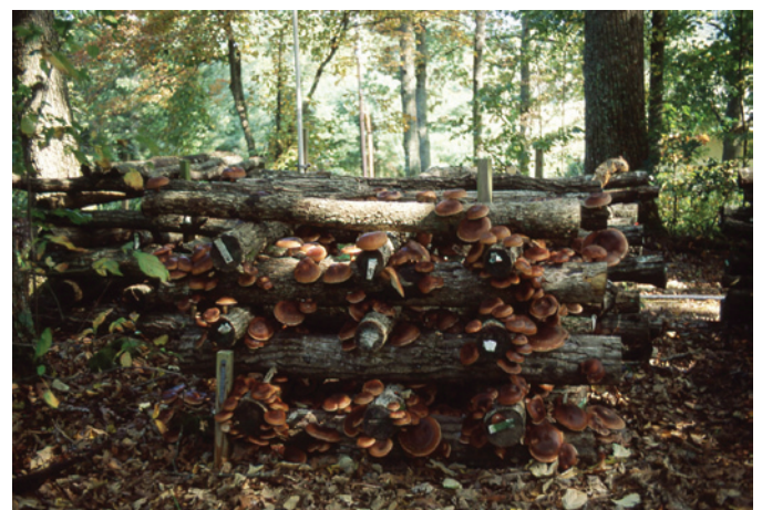
Figure 9. Mushrooms ready for harvest.

Daily harvesting is required during fruiting periods (Figure 9). Mushrooms should be picked while there is still a small curl at the edge of the cap, usually five to seven days after the mushroom first appears. Mushrooms should be cut or twisted off at the base of the stem. Then they should be gently placed into smooth-sided, clean, vented containers. Do not stack the mushrooms more than six inches high, to prevent bruising. Cool the mushrooms to a temperature