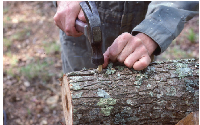
Figure 4. Dowels are pounded into the holes with a hammer.

As an alternative, foam plugs may be made to insert after the spawn has been placed in the holes. The plugs can be cut from the foam backing cord made for filling cracks in concrete slabs. Backing cord is available through building suppliers. A razor blade can be used to easily cut the foam backing cord into \frac{1}{4} -inch to \frac{1}{2} -inch discs. Although using the foam plugs is safer than working with wax, it takes much longer to make the plugs and insert them than it does to melt and apply hot wax. Also, some growers have