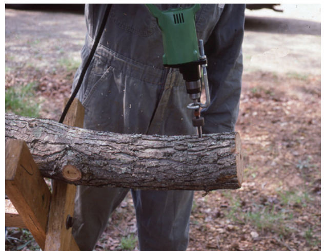
Figure 2. Holes are drilled in the log with a high-speed drill.

Sawdust or dowels are placed in holes drilled into the logs (Figure 2). Spawn suppliers usually provide detailed information on hole depth and diameter. The general practice is as follows: starting 1 inch from the end of the log, drill holes 3 inches apart in rows along the length of the log, with 3 to 4 inches between rows. The holes should be staggered in a diamond pattern to ensure rapid growth of the fungus throughout the log (Figure 3). Closer spacing increases the rate of colonization and results in more rapid mushroom production; however, spawn costs are also greater.