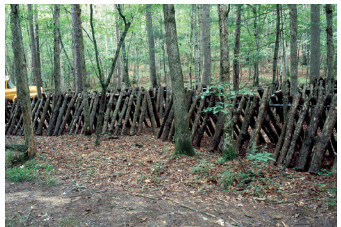
Figure 7. Lean-to stacking system.

For example, if the initial fresh weight of the slice was 8 ounces and the oven-dry weight was 4.2 ounces: