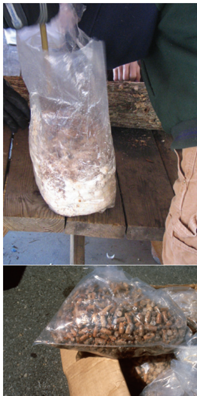
Figure 1. Shiitake spawn is available in sawdust (top) or on wooden dowels (bottom).

They are covered with mycelium, a fuzzy, white growth similar in texture to bread mold. The spawn can be stored in a refrigerator or cold room for several months but should be held at room temperature for several days before inoculation. Sawdust spawn is usually sold in bags or bottles. Dowels are usually sold in bags of one thousand, and thimble spawn is usually sold in sheets of six hundred. Results from some studies suggest that sawdust spawn produces mushrooms faster than dowels and is generally less expensive. Many new producers, however,