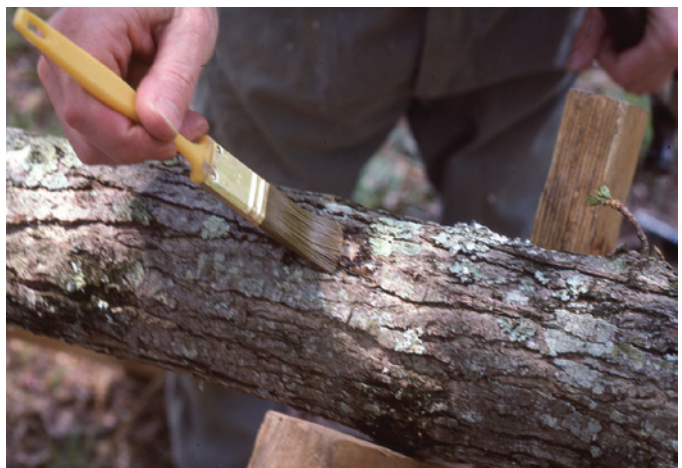
Figure 5. Holes filled with spawn are sealed with hot wax.

reported that squirrels and birds sometimes remove the plugs from the logs.