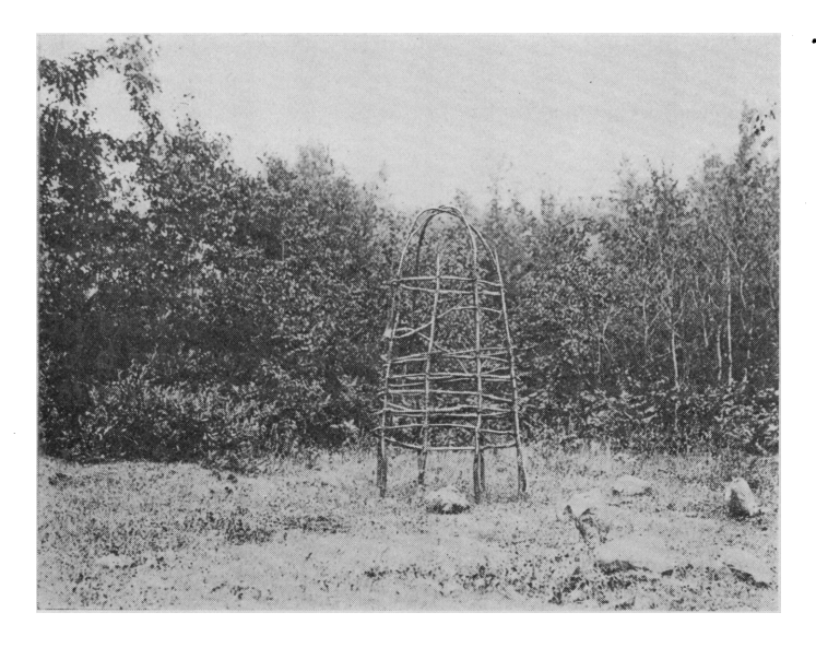
Fig. 2. Framework of a Je'sakan.

In the evening, just about sundown, the performer's clients appear, bringing liquor for him to use; partly to pour libations to the gods, and