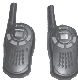
Family Radio Service (FRS) radios

Family Radio Service (FRS) units also operate on line of sight, but the effective range is considerably shorter than GMRS, typically well under a mile. However, the FRS radios don't require a license and are usually more inexpensive.