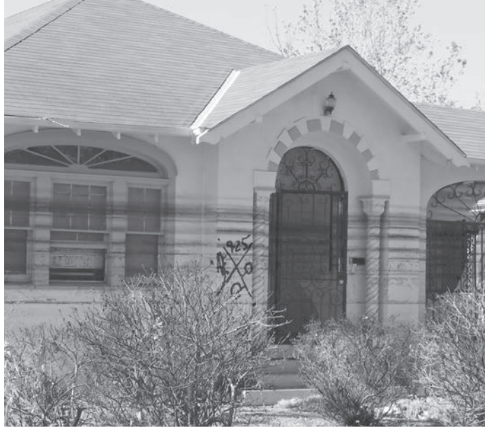
An abandoned-looking home may be just as much of a deterrent to intruders as a heavily fortified one.

The strategy you choose will depend on your location and the circumstances of the actual collapse. If you are in an urban or suburban area, odds are pretty good that you'll have neighbors who will be struggling to survive. You can do anything you want to your home to make it look burned out and abandoned, but these people will know you are still occupying the structure. Unless you can get the entire neighborhood to go along with the ruse, the idea is something of a non-starter.