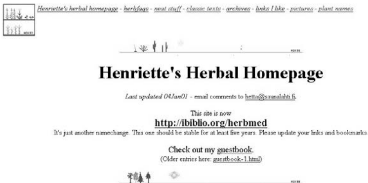
FIGURE 4.1. Henriette's Herbal Home Page: One of the Most Popular Herbal Internet Sites

This is another well-established and well-known personal Internet site for herbal information, but with a strong theological or mystical