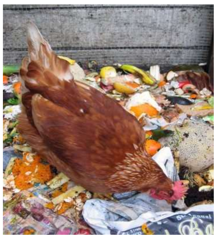
(Free Range Chicken rooting around in compost)

Chicken droppings are rich in nitrogen. Mix the droppings, your roost bedding and leftover eggshells into your compost for a rich, organic, fertilizer that will make your garden the envy of the neighborhood. Best yet, it's pesticide and chemical free, making it perfect for vegetable gardens.