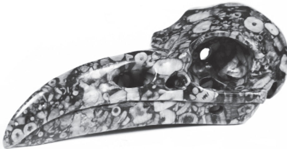
Crinoid fossil Raven head ( www.skullis.com )

A blackish raven skull had called to me when I was trawling through the Skullis website. On closer inspection, I could see that the crystal was iridescent with shining streaks of gold and silver. It looked like a meteor shower falling through the night sky. It arrived just as I was about to lead a crystal medicine wheel workshop, so I took it along to represent air and put it beside a rather special raven's feather. Ravens nest just up the road from my home, and the previous year I had had the incredible experience of chatting to a young raven as it sat on a branch high above me. These birds really do talk! Having given me the soul guidance I needed, he'd dropped me the feather as we said goodbye.