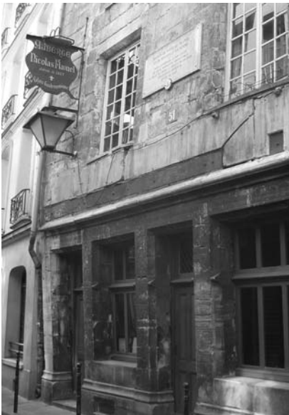
Front entrance to the Auberge Nicolas Flamel (the Nicholas Flamel Hostel) on Rue du Montmorency, Paris.