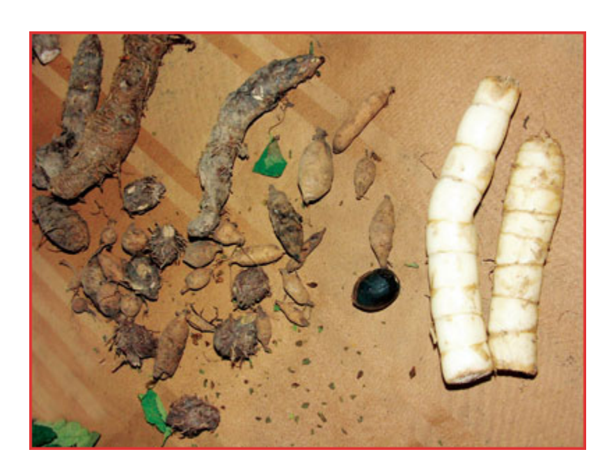
Buseta (Eva), a female pusanga plant used to awaken passion in the opposite sex. Buseta (Adan), a male pusanga plant used by men for the same reasons. The man rubs the perfume "Adan" on his penis so women become aroused by him. The "Eva" is ground into powder and used by women for the same purpose.