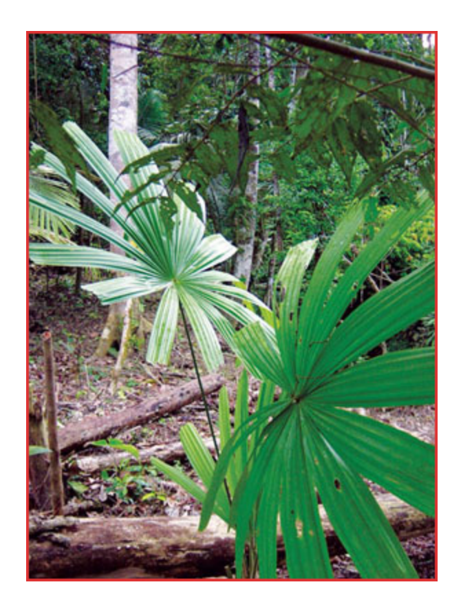
Leaves of the chacapa bush. These are dried and bound together to create a natural rattle and healing tool, also known as a chacapa.