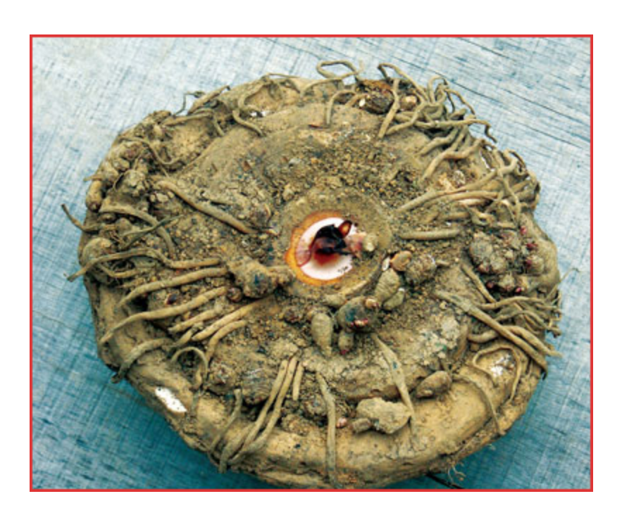
The root of the jergon sacha tree, which is used in the snake medicine.