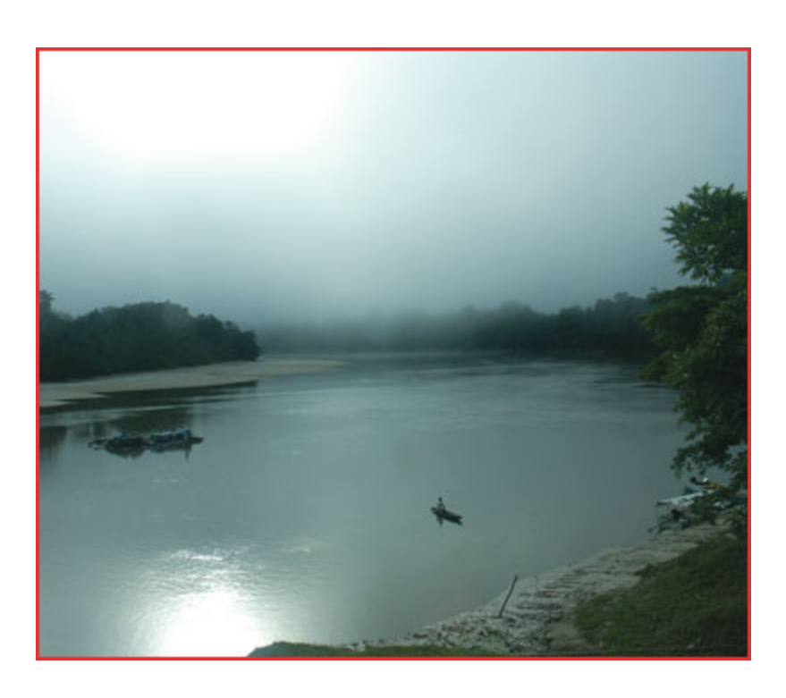
Day breaks over the Amazon.