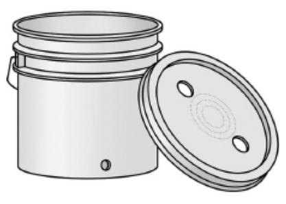
Bucket B with lid